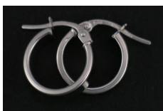
E309 Mitat: 10*13*3,5 mm flakka