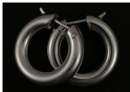
W331 750‰ Mitat: 12*21*4,5 mm