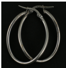
E343 Mitat: 22*26*2 mm