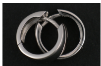
W388 Mitat: 10*14 mm